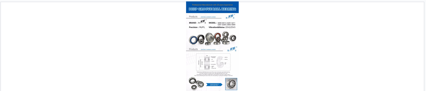
Detailed cross-section showing the inner ring, outer ring, cage, and ball assembly of a deep groove ball bearing.