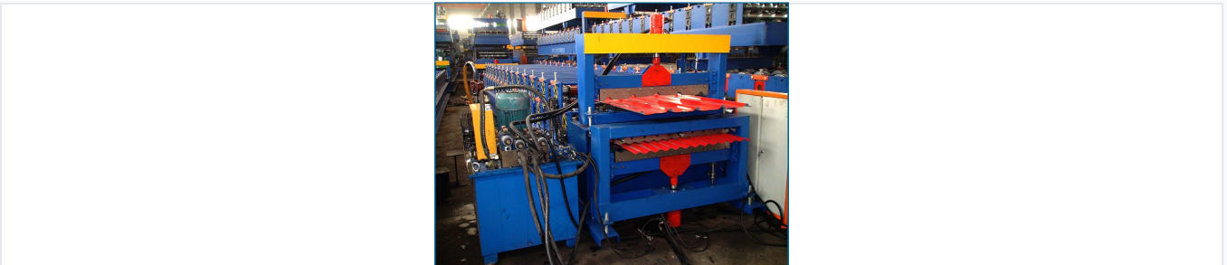
Industrial-grade construction designed for high-volume production of roofing materials.