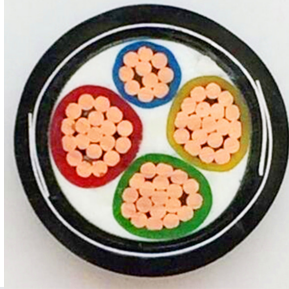
Detailed view of internal conductor and armoring layers.