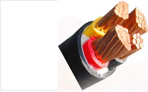
Standard construction of NYY power cables featuring copper conductors and PVC protective layers.