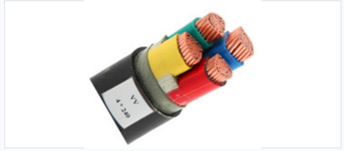
Durable PVC sheath and insulation designed for reliable power distribution.