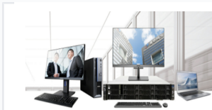
PC with Independent IP