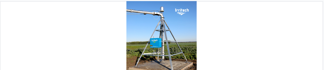
Overview of the center pivot irrigation system installed in an agricultural field.