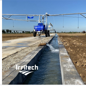
Detail view of the irrigation system structure and drive mechanism.