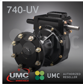
Control panel and tower box assembly featuring safety indicators and troubleshooting access.