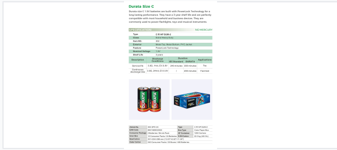
Detailed performance metrics and technical specifications.