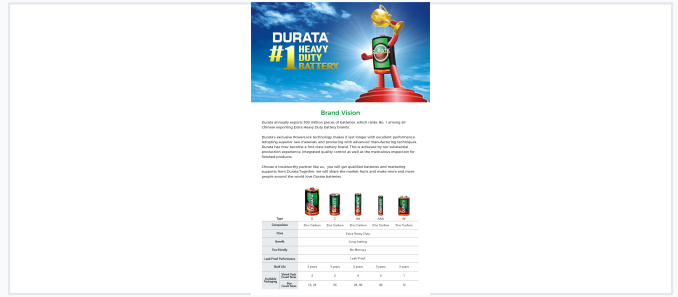
Environmentally conscious design with a 3-year shelf life.