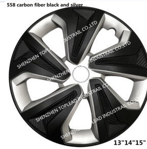
Classic black and silver finish option.