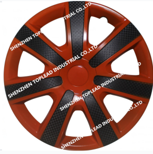
Sporty black and red color combination.