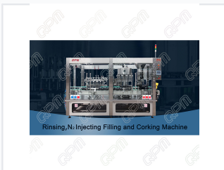
Rinsing, N 2 Injecting Filling and Corking Machine