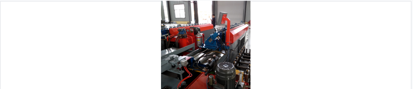
Full view of the automatic roll forming line featuring multiple forming stations and integrated control arm.