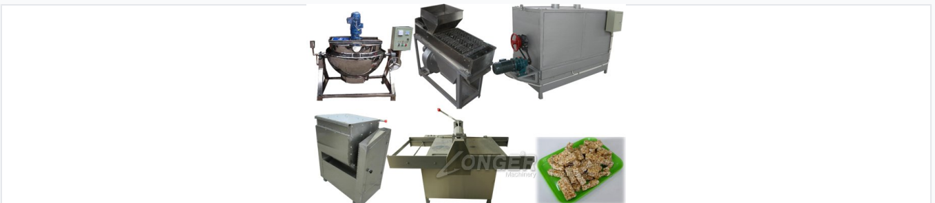
The complete production line including roasting, melting, mixing, and cutting modules for streamlined candy manufacturing.