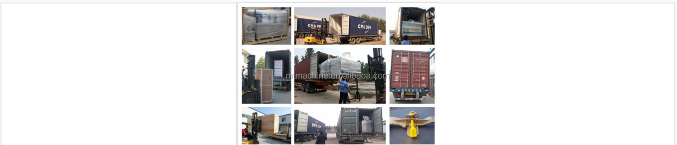
Equipment is securely packed in industrial containers for international transit.