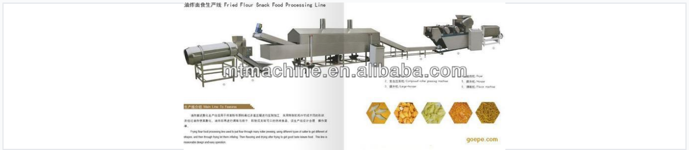
Overview of the compound roller pressing and frying stages of the production line.