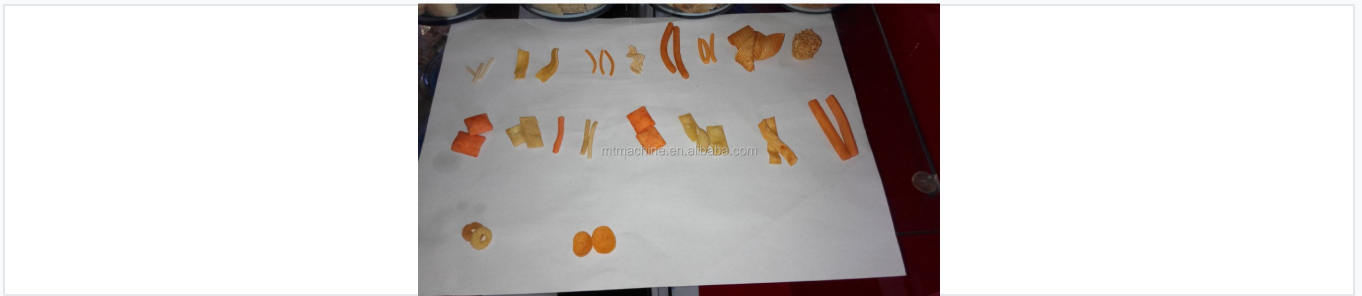
The production line supports a wide variety of shapes including curls, squares, and rings.