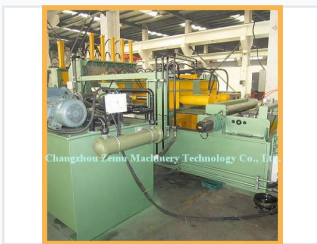
Changzhou Zemu Machinery Technology Co., Ltd.