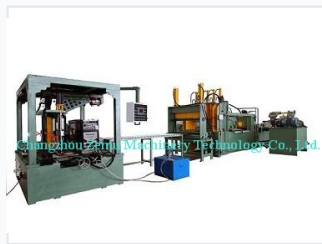
Changzhou Zemu Machinery Technology Co., Ltd.