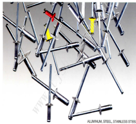
Blind rivets available in aluminum, steel, and stainless steel.