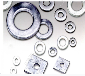
Assortment of flat and square washers for load distribution.