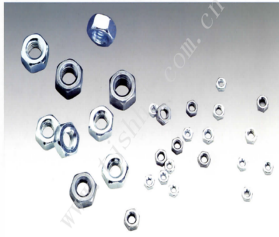
Comprehensive selection of DIN934 hexagon nuts.