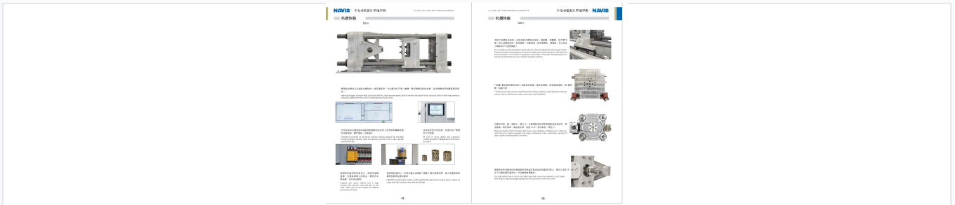
Detailed view of the zero-resistance clamping structure, high-rigidity toggle system, and professional controller interface.