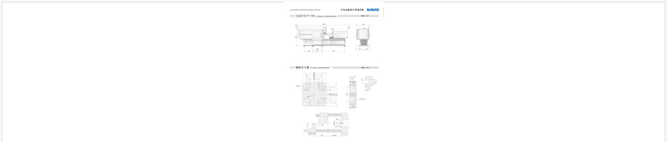
Dimensional schematics for the SE-300A, including platen hole patterns and overall machine footprint.