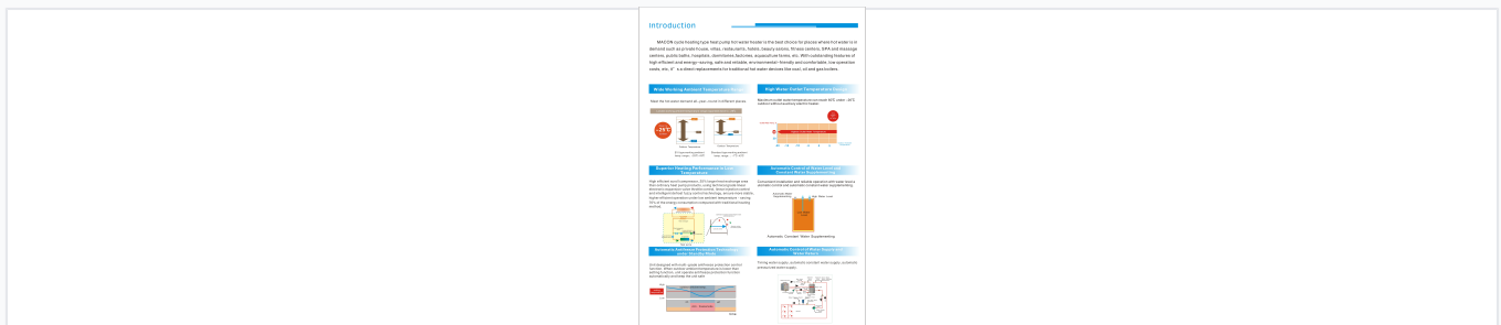
Diagram showing the cycle heating system and integration for various residential and commercial applications.