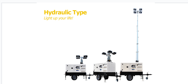
Hydraulic light tower featuring a 9-meter high mast equipped with energy-efficient LED lights.