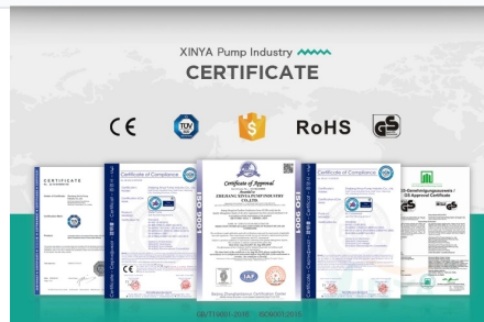
The system meets international quality and safety standards including CE, ISO, and RoHS.