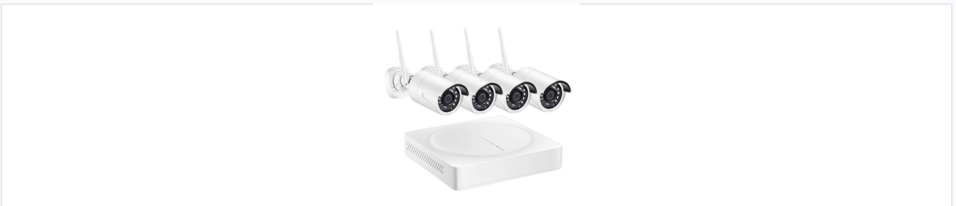
Complete 8-Channel Wireless Security System setup.