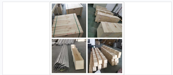
High-quality aluminum blades and secure wooden crate packaging for international shipping.