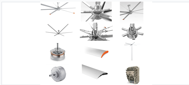
High-efficiency motor with IP66 protection for durable operation in demanding environments.