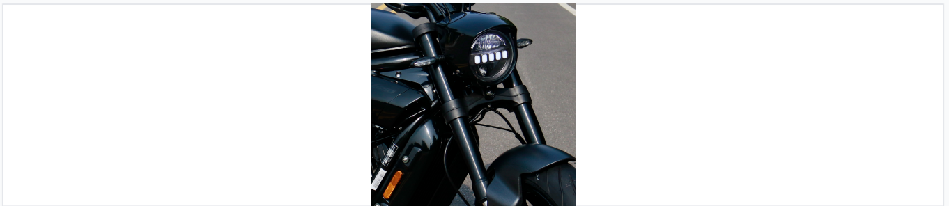
A modern cruiser design optimized for comfort and performance.