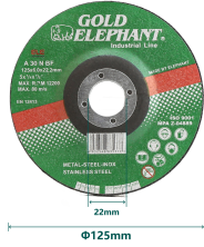
Technical layout showing dimensions and safety ratings.

Two-net inside reinforced Circle 'NO. 30' 'SA' denotes Grinding disc with two-net inside reinforced or two and a half net reinforced.