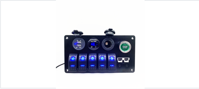
High-end luxury switch panel with blue LED indicators.