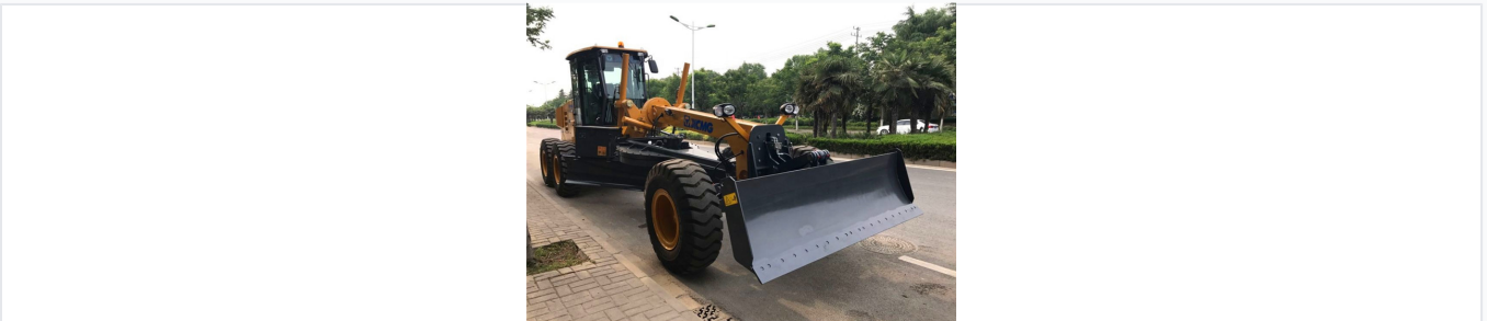
Heavy-duty motor grader performing precise grading operations.