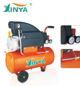
Compact 24-liter direct-drive air compressor