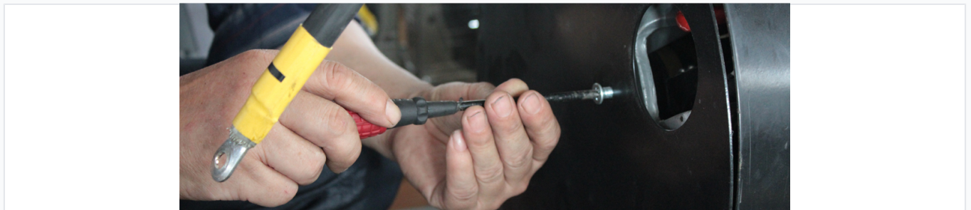
Detailed workmanship ensuring secure electrical grounding and connectivity.