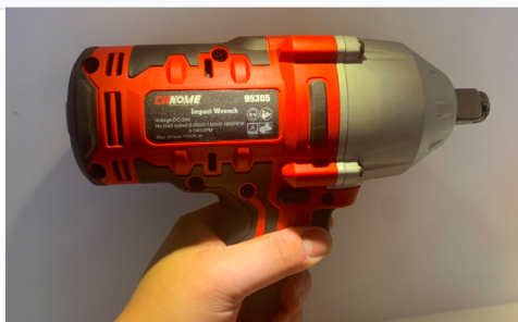
Technical overview of the impact wrench capabilities and speed settings.