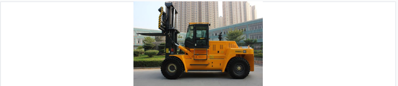
Robust 20-ton capacity forklift designed for heavy industrial material handling.