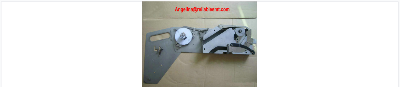
Precision-engineered 16mm feeder designed for reliable component delivery in SMT assembly lines.