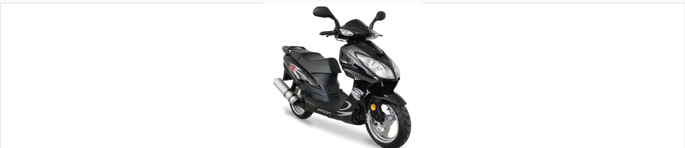
Sleek and stylish design optimized for urban commuting.