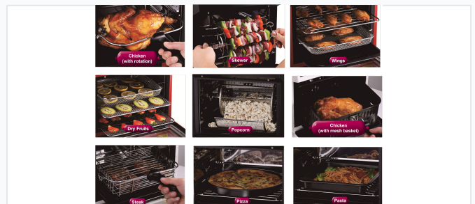
Versatile cooking modes for chicken, pizza, steak, and more.