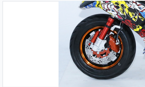
Front wheel assembly featuring a hydraulic disc brake and orange rim.