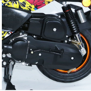
Detailed view of the 110cc engine assembly and rear suspension system.